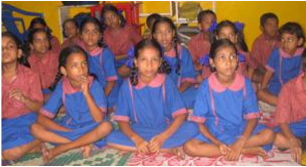
Children from slum are pictured in a class, Ek Prayas School, Kolkata.